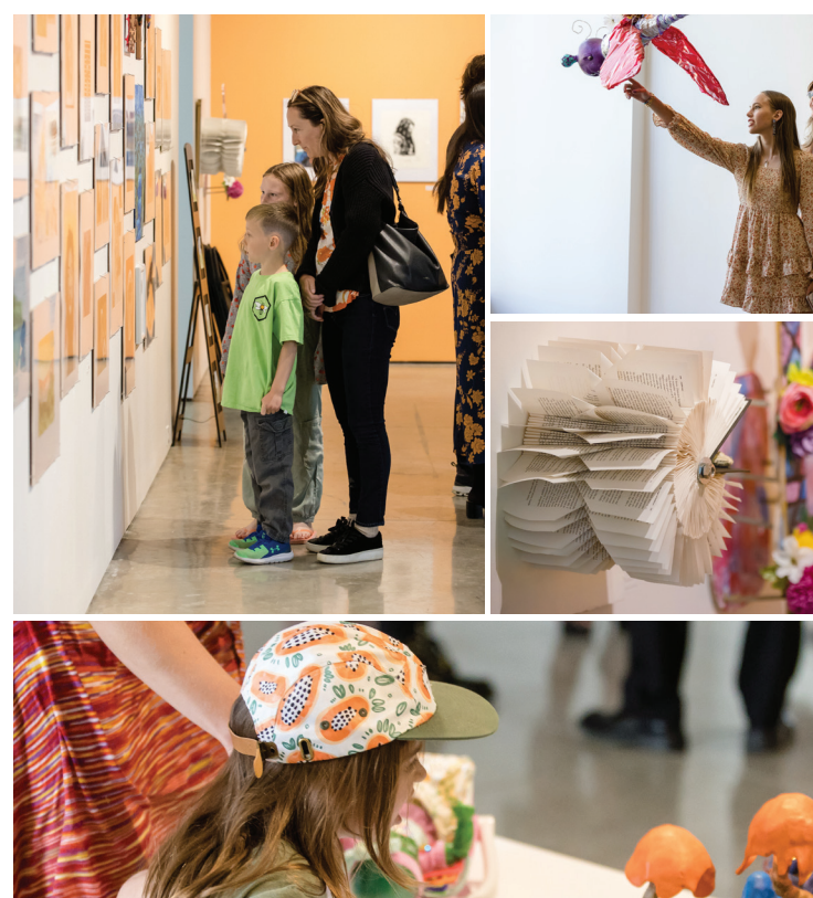
Art's Alive and Well in the Schools exhibition opening 2022.