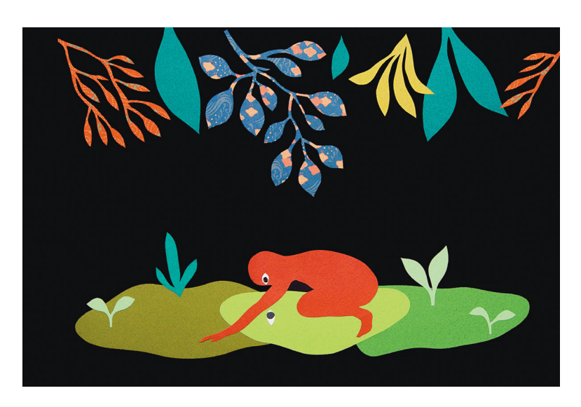
April Matisz, A Kind of Sentience, collage, 2020.

A necessary act for survival, gathering involves traversing a landscape, coming to know it by searching and assessing, selecting and collecting. The physical act of picking berries,